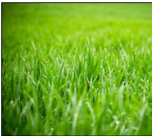
Any soft land around the charge location for the Earthing Rod