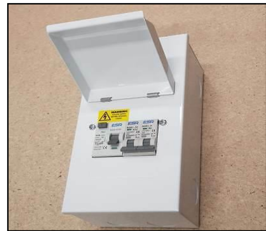
Any sub-boards, garage boxes or any other electrical components, eg. Solar