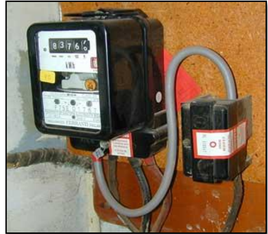
The head of your incoming electrical supply and main fuse