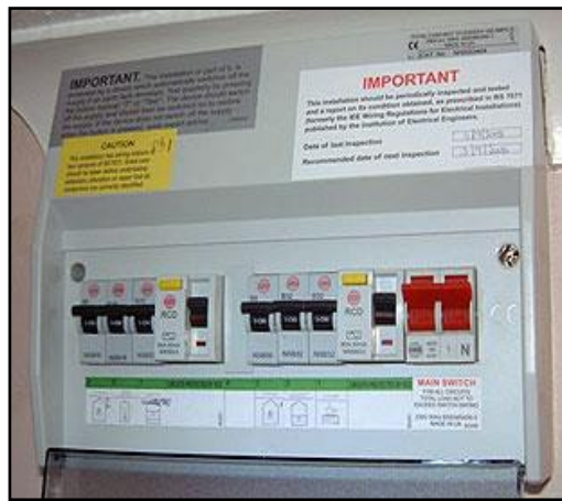
Your main consumer unit and the area around it (please show fuses)