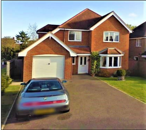
Your home showing off street parking and desired charger location

Please take photographs of the following and send them to info@chilternsolar.co.uk Many Thanks!